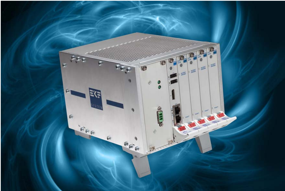
CRB-BLUELINE with DC Power Supply