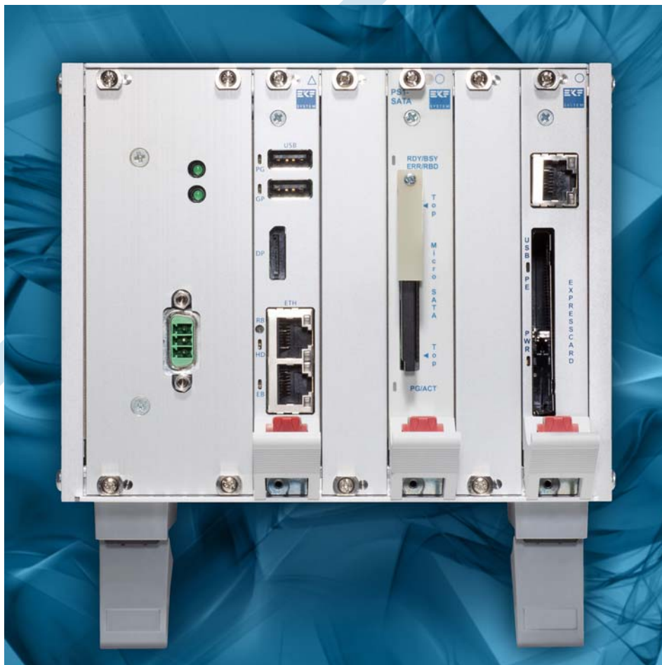
CRB-BLUELINE Custom Specific