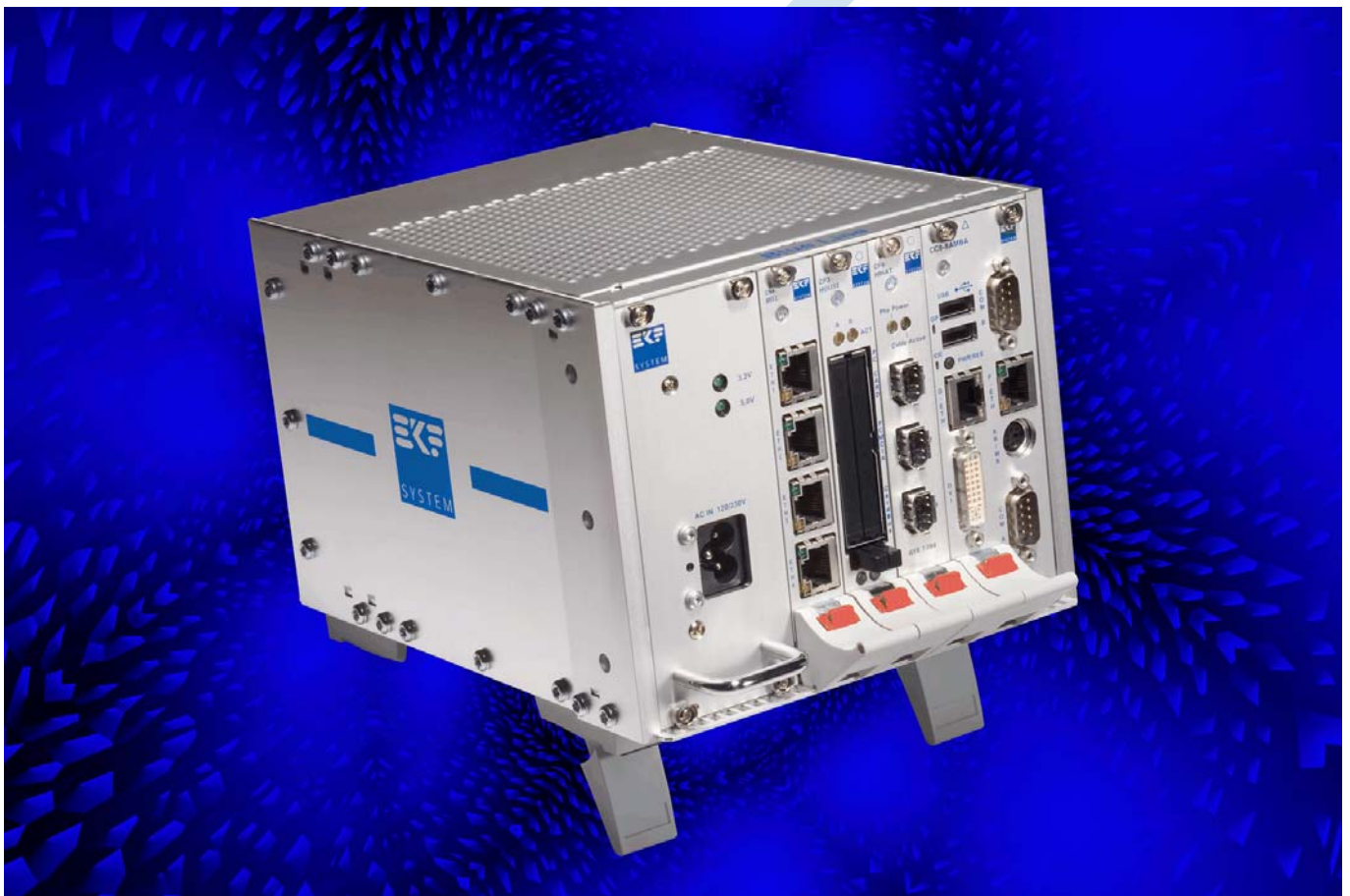
CRB-BLUELINE Small Expandable Systems

Document No. 3661 • Last Edited 18 April 2017