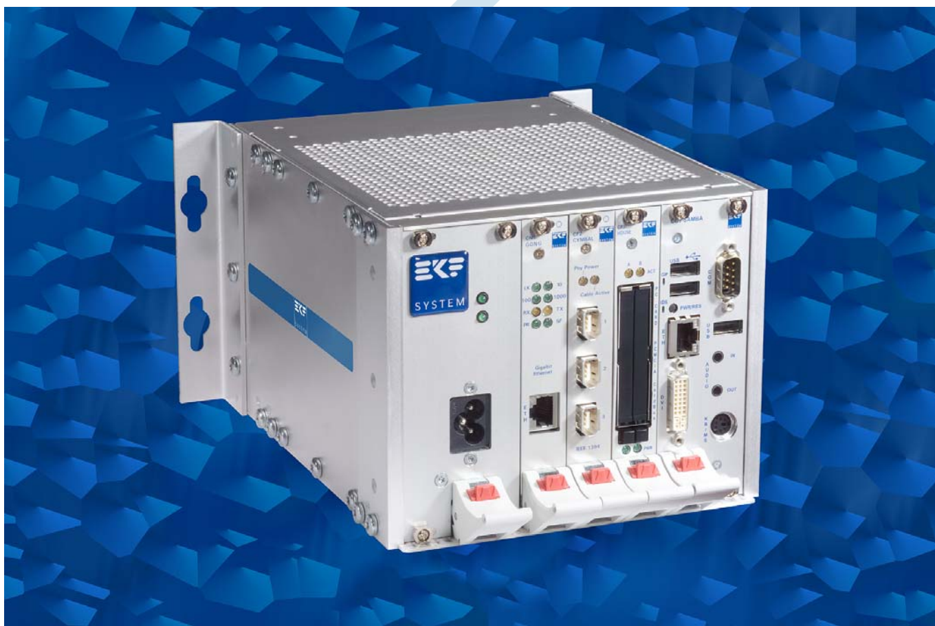
CRB-BLULINE w. Wall Mount Brackets

The overall reliability of any system depends in particular on the quality of its power supply unit. BLUELINE systems are provided with a removable, high-grade industrial PSU from a leading German manufacturer. As of current, the CRB-BLUELINE systems can be equipped with PSU versions suitable either for 120/230VAC or 24VDC power line input (automotive applications). The BLUELINE is a long-time available and scalable IPC system, combining high reliability and small size with an affordable price, thus forming the better alternative compared to many other PC based solutions. Please request for custom specific versions, tailored to your individual needs. Quality pays, its up to you!