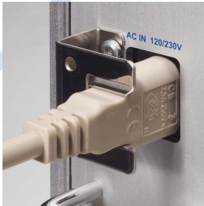
AC Power Cord Fastener