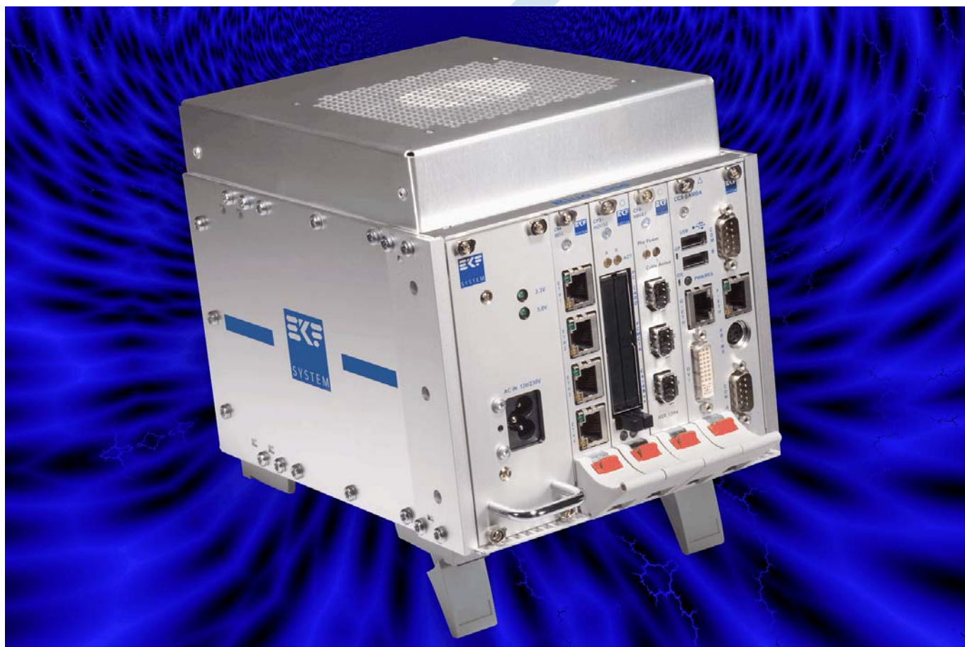
CRB-BLUELINE with Fan Unit for High Performance CPU Usage

A mass storage device, either 2.5- or 1.8-inch SSD, or a CompactFlash (option CFast) card, is integral part of the CPU module. Cooling by natural convection is already sufficient for low power processor boards.