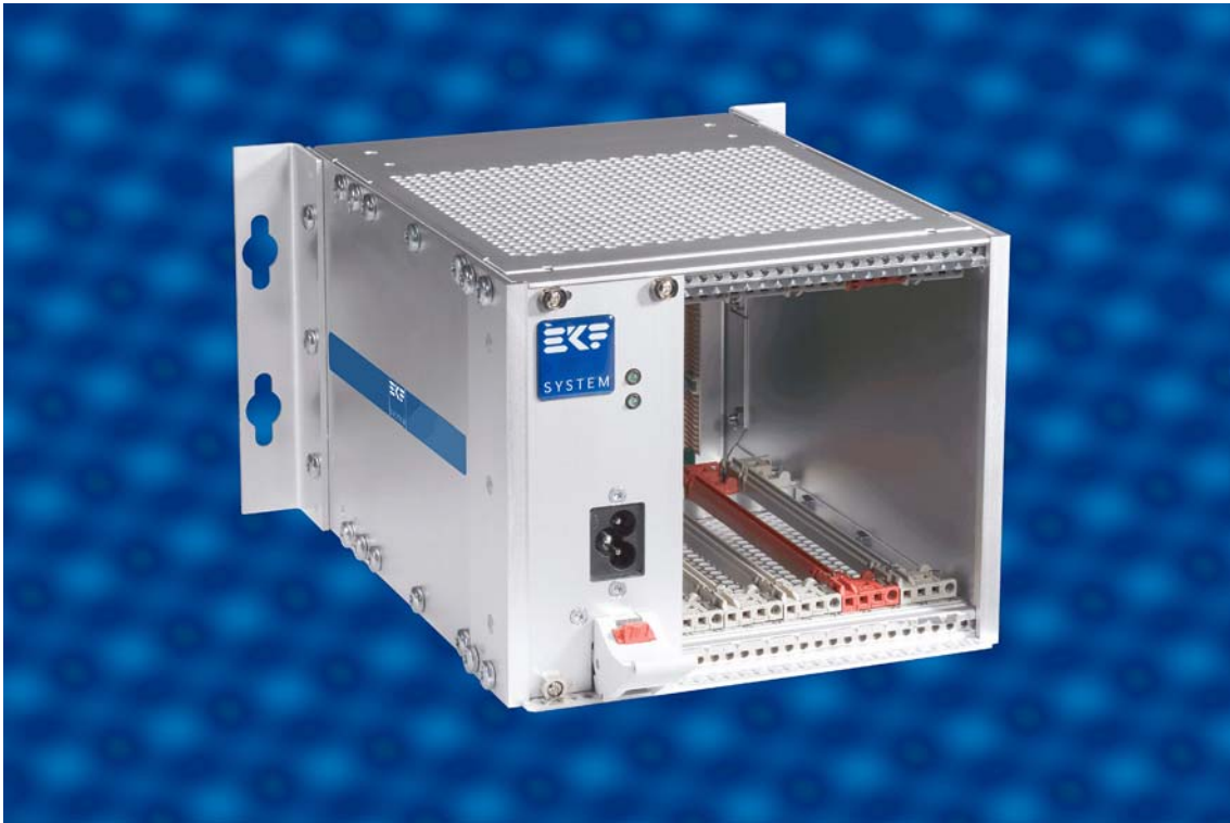
CRB-BLUELINE with Wall Mount Brackets